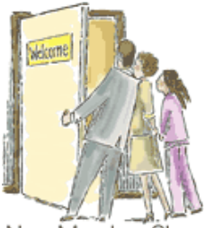
New Member Class